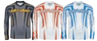
Yellow (10) Red (30) Blue (80)

Sizes: S, M, L, XL, 2XL 453309 Yellow (10), Red (30), Blue (80)