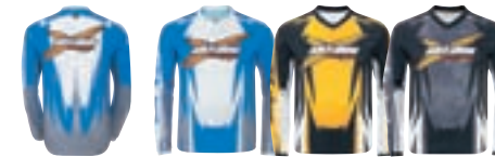
Back White (01) Yellow (90) Black (90)

Sizes: S, M, L, XL, 2XL 453308 White (01), Yellow (10), Black (90)