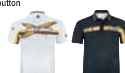
White (01) Black (90)

100% Polyester Sizes: S, M, L, XL, 2XL, 3XL 453325 White (01), Black (90)