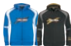
Blue (80) Black (90)

75% Cotton, 25% Polyester Sizes: S, M, L, XL, 2XL, 3XL 453315 Blue (80), Black (90)