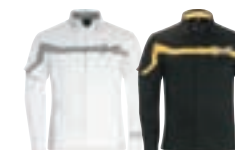
White (01) Black (90)

97% Cotton, 3% Spandex Sizes: S, M, L, XL, 2XL, 3XL 453323 White (01), Black (90)