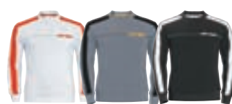
White (01) Charcoal Grey (07) Black (90)

75% Cotton, 25% Polyester Sizes: M, L, XL, 2XL, 3XL 453316 White (01), Charcoal Grey (07), Black (90)