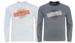
White (01) Charcoal Grey (07)

▪ Printed logo. 95% Cotton, 5% Spandex Sizes: M, L, XL, 2XL, 3XL 453294 White (01), Charcoal Grey (07)