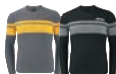
Charcoal Grey (07) Black (90)

100% Cotton Sizes: M, L, XL, 2XL, 3XL 453177 Charcoal Grey (07), Red (30), Black (90)