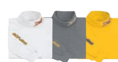
White (01) Charcoal Grey (07) Yellow (10)

86% Polyester, 14% Spandex Sizes: S, M, L, XL, 2XL 453245 Black (90)