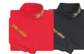
Red (30) Black (90)