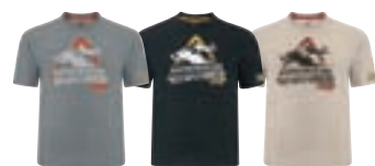
Charcoal Grey (07) Black (90) Warm Grey (15)

▪ Stretchable fabric ▪ Printed logo 95% Cotton, 5% Spandex Sizes: M, L, XL, 2XL, 3XL 453292 Charcoal Grey (07), Warm Grey (15), Black (90)