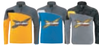
Yellow (10) Blue (80) Black (90)

Sizes: S, M, L, XL, 2XL, 3XL 453298 Yellow (10), Blue (80), Black (90)