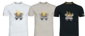
White (01) Warm Grey (15) Black (90)

▪ Heat transfer print. 95% Cotton, 5% Spandex Sizes: M, L, XL, 2XL 453289 White (01), Warm Grey (15), Black (90)