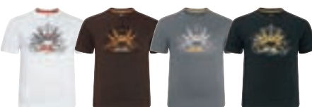
White (01) Brown (04) Charcoal Grey (07) Black (90)

▪ Stretchable fabric ▪ Printed logo 95% Cotton, 5% Spandex Sizes: M, L, XL, 2XL 453288 White (01), Brown (04), Charcoal Grey (07), Black (90)