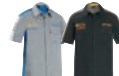
Grey (09) Black (90)

97% Cotton, 3% Spandex Sizes: M, L, XL, 2XL, 3XL 453322 Grey (09), Black (90)