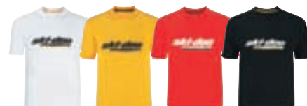
White (01) Yellow (10) Red (30) Black (90)

▪ Stretchable fabric ▪ Printed logo 95% Cotton, 5% Spandex Sizes: M, L, XL, 2XL, 3XL 453290 White (01), Yellow (10), Red (30), Black (90)