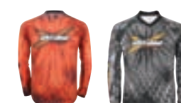
Back Black (90)

Sizes: S, M, L, XL, 2XL 453310 Orange (12), Black (90)