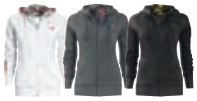
White (01) Charcoal Grey (07) Black (90)

75% Cotton, 25% Polyester Sizes: S, M, L, XL, 2XL 453318 White (01), Charcoal Grey (07), Black (90)