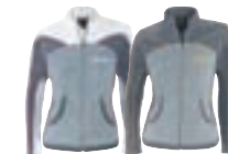
White (01) Charcoal Grey (07)

100% Polyester Sizes: XS, S, M, L, XL, 2XL, 3XL 453357 White (01), Charcoal Grey (07), Ice (38)