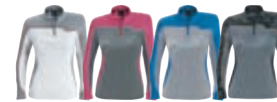
Grey (09) Raspberry (39) Blue (80) Black (90)

100% Polyester Sizes: S, M, L, XL, 2XL 453301 Grey (09), Raspberry (39), Blue (80), Black (90)